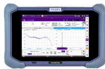
OneAdvisor-800 All-in-One Cell-site Installation and Maintenance Test Solution