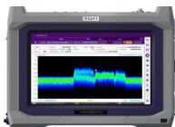
CellAdvisor 5G Cell site test solution