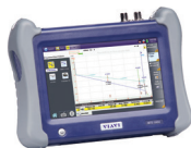
T-BERD/MTS-5800 Handheld test instrument for testing 10 G Ethernet and fiber networks