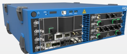
LTB-8 EIGHT-SLOT RACKMOUNT PLATFORM

WINDOWS ENVIRONMENT | BUILT-IN APPLICATIONS | THIRD-PARTY APPLICATIONS SCALABLE | HOT-SWAPPABLE MODULES | USB